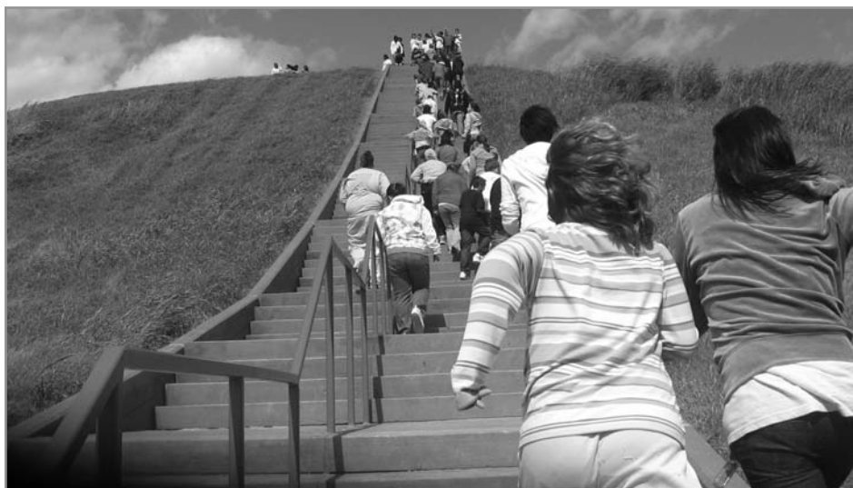
Students climb and race to the top of Monk's Mound