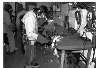
Welding offers many challenges

Many students left Career Connect with a new understanding about one of their career interests. Often they had an item they made or a memorable experience to share that related to a field they were considering exploring at the high school or college level. The goal was to enhance career education at the middle school level by providing a fun, exciting, and informative experience through Career Connect. Following the field trip, students were heard saying, "This was the best field trip ever!" hsd