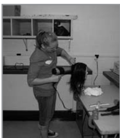
A student tries her hand at hairstyling a wig.

The 8th grade class recently visited South Technical High School for the Career Connect on Oct. 1st and 2nd. Career Connect is an 8th grade exploratory program which allows students to participate in a variety of related careers through hands-on activities and projects. Using a career survey, the students were divided into morning and afternoon activities based on their top career interest areas. The eight clusters were developed based on Missouri's Center for Career Education's cluster arrangement.